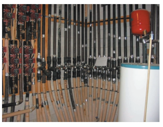
Compact mechanical room houses pipes and pumps. Gino DiRezze of Ground Heat Systems<sup>®</sup> opted for a unique pumping system for the Metrus Building.

Operating costs and maintenance costs for earth energy an system should be documented to help pinpoint performance improvements. ١n addition, metering and monitoring plans are essential to ensure that the expected energy savings materialize and are maintained over the life of the equipment.